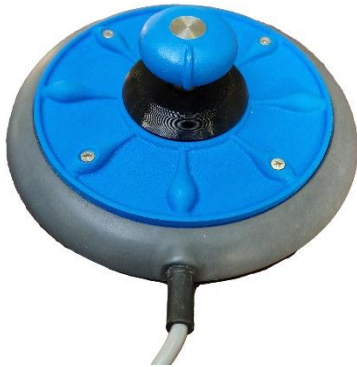
Figure 1: Moozi

This FSN applies to all Moozi units, although not every Moozi unit may be impacted.